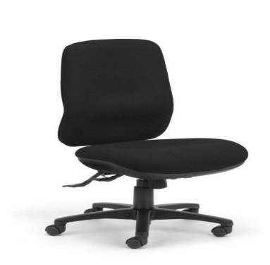
Bodyline - High Back 2lv ratchet